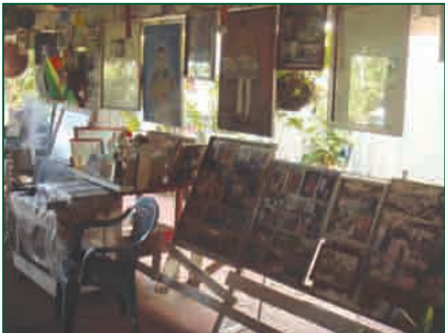
Inside Roy's steel pan museum