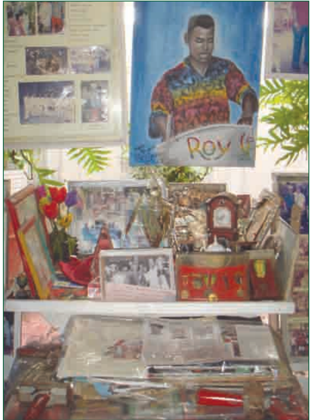
The official awards table