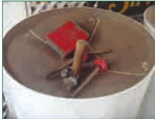
The pan tuning kit